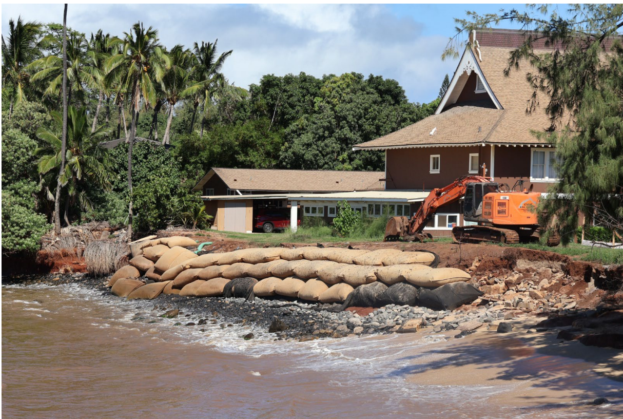
Figure 1 Sandbags used for temporary erosion control at Mantokuji Bay