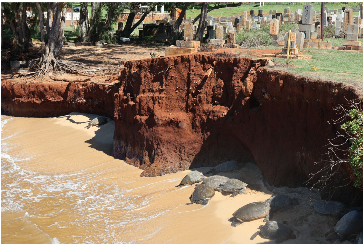
Figure 2 Turtle resting on the beach fronting the cemetery at Mantokuji Bay