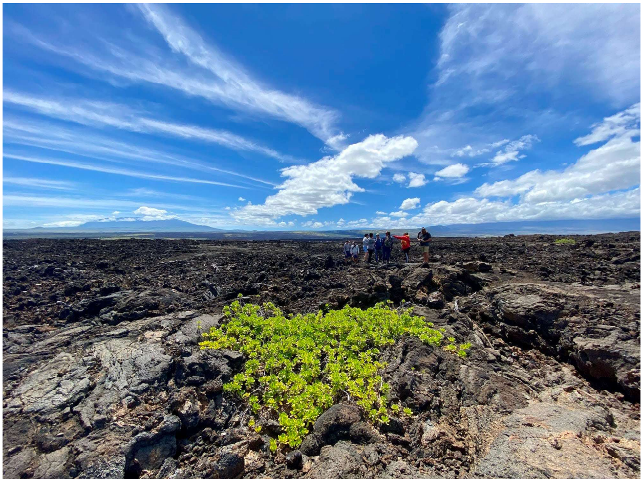
LLCP 2024-01, ‘Anaeho‘omalu Kapalaoa District of North Kona, Island of Hawai‘i Scheduled to close during Fiscal Year 2026

The LLCP also manages existing grants, contracts, and state financial accounts that support $200,000 in land management grants, allocated among five properties conserved through the Land Conservation Fund, and provides $10,705,542 from prior fiscal years for seven pending land acquisitions valued at $26,358,7929 (estimated total project costs). These seven acquisitions will conserve over 1,176 additional acres across the Hawaiian Islands (‘Anaeho‘omalu Kapalaoa and Nani Kai Hoku Agricultural Easement), O‘ahu (Kāne‘ohe Pali to Lo‘i, Pālāwai, Makali‘i, and Loko Ea Queen's Residence), and Kaua‘i (Kamealoha Kuleana Conservation Easement).