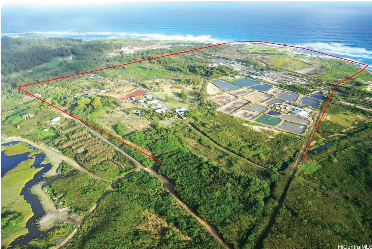
Aerial image of Ke Kīpuka o Kalaeuila (outlined in red)

Conservation Easement: City & County of Honolulu