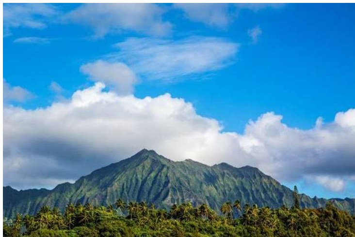
Kāneʻohe Pali to Loʻi

The Legacy Land Conservation Program indicated its belief that the Awardee, with support from partners, is working diligently to complete the transaction and will likely do so within a reasonable timeframe. BLNR deferred action on the grant award until the 2026 annual review.