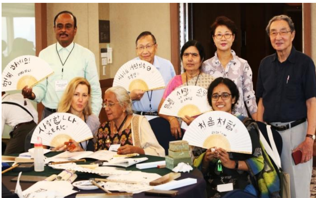
Participation of EWCA members from various countries during 2018 Seoul Conference

In addition to the gaining knowledge and experience in the relevant field, we could establish EWCA Chennai Chapter and render voluntary services in the area of education, environment, climate change and health aspects. We also disseminate the knowledge, excellent role and responsibility undertaken by EWC, Hawaii in organizing various needy programs.