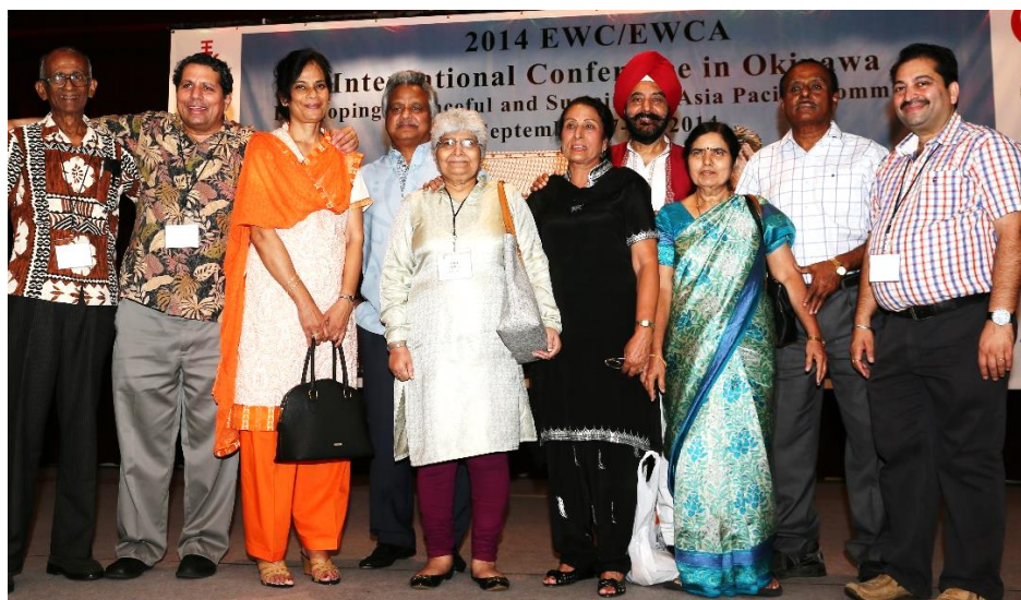
EWCA participants from India, Pakistan, Bangladesh, etc. - Unity among diversified alumni team

We diversified experts from various Pacific Basin & Asian countries got the opportunity to participate in the EWC organized and supported programs for the past 60 years. During 1994 and 1996, I have participated the programs organized through Pacific Basin Consortium (PBC) Environment & Health, gained knowledge in Environmental Protection aspects in Asian and Pacific basin countries such as USA, Canada, Japan, China, South Korea, Singapore, Malaysia, India, etc.