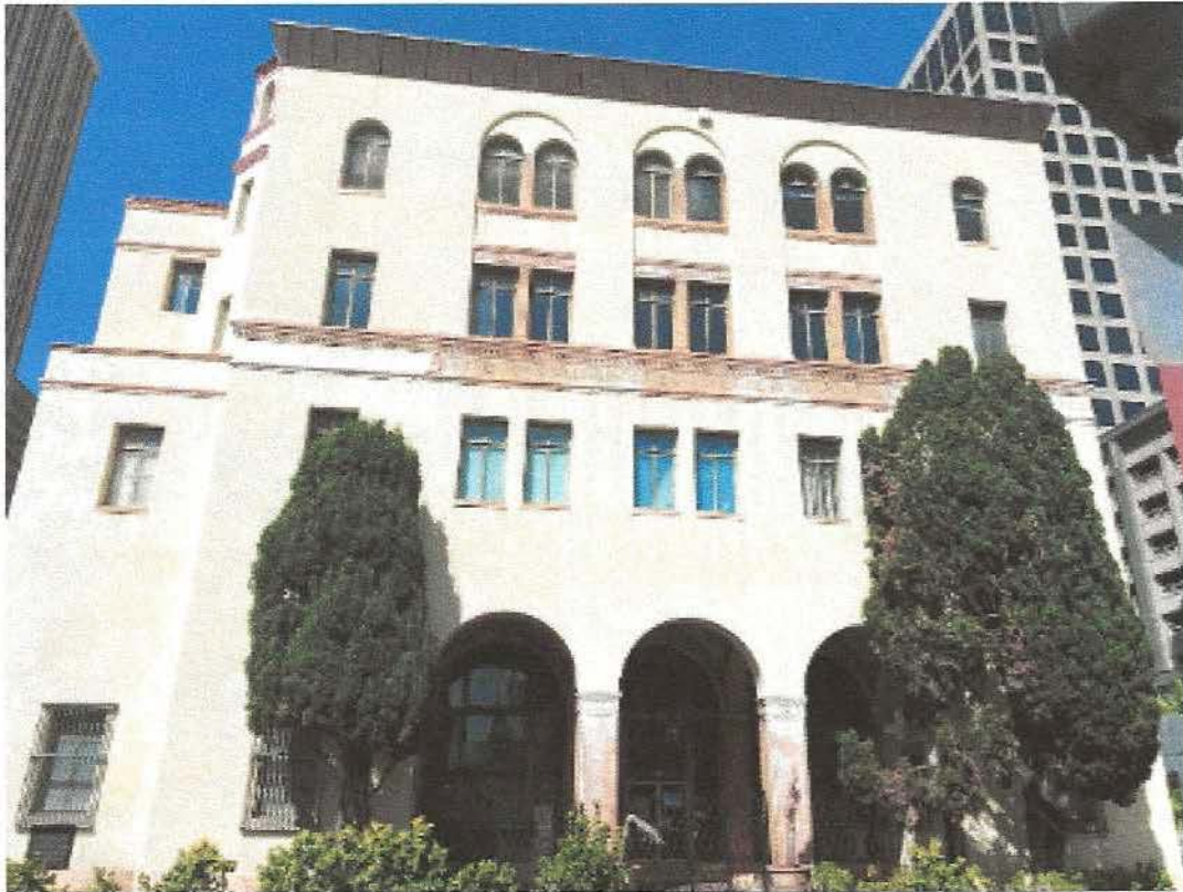
900 Richards Street, downtown Honolulu.

The museum is located on the ground floor of the old Hawaiian Electric building at 900 Richards Street. The structure was built in 1927 and is a historic property. The 11,000 square feet of space on the ground floor is satisfactory for the museum's first couple of years of operations. Because of the building's age constant maintenance is required.