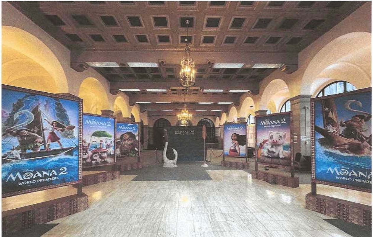
Inside the Inspiration Hawaii Museum. Disney's Moana 2 exhibit on December 7, 2024.