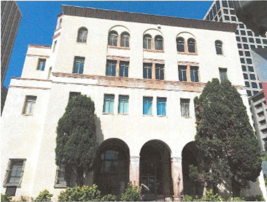
900 Richards Street, downtown Honolulu.

The museum is located on the ground floor of the old Hawaiian Electric building at 900 Richards Street. The structure was built in 1927 and is a historic property. The 11,000 square feet of space is satisfactory for the museum's first couple of years of operations. Because of the building's age constant maintenance is required.