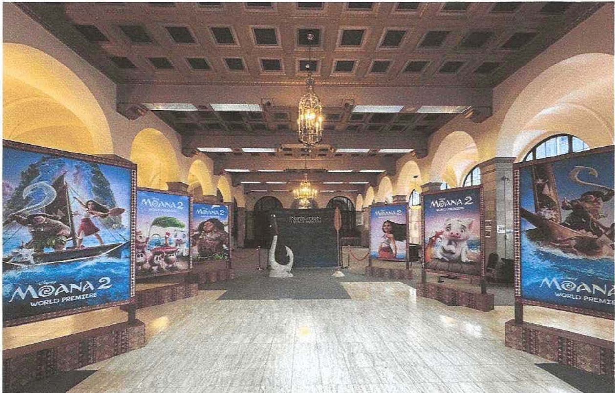
Inside the Inspiration Hawaii Museum. Disney's Moana 2 exhibit on December 7, 2024.