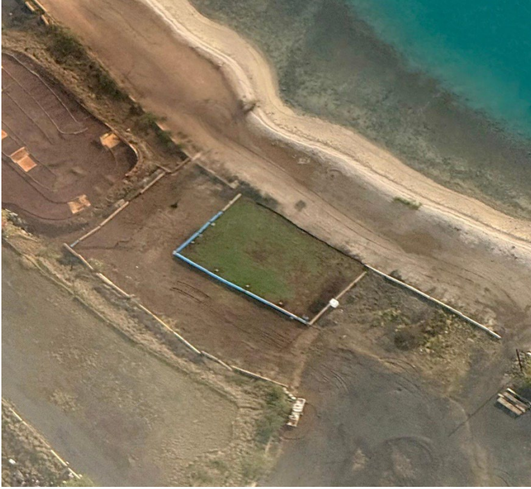
The grass is growing