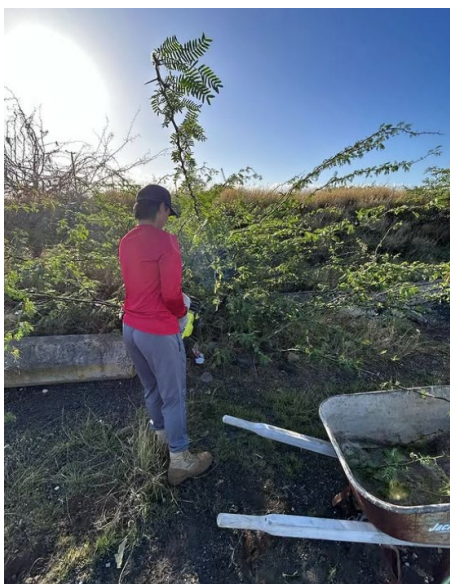
Getting rid of long-thorn kiawe

IOCC operates from a canoe site at Sand Island (Maui Ola) on DLNR land. IOCC has executed a special use permit and an adopt-a-park memorandum of agreement for stewardship of the practice site. The club does not own any buildings or structures as these are not permitted on the beach site. IOCC has improved the site by relocating/removing large rocks, removing invasive long-thorn kiawe plants, and planting grass.