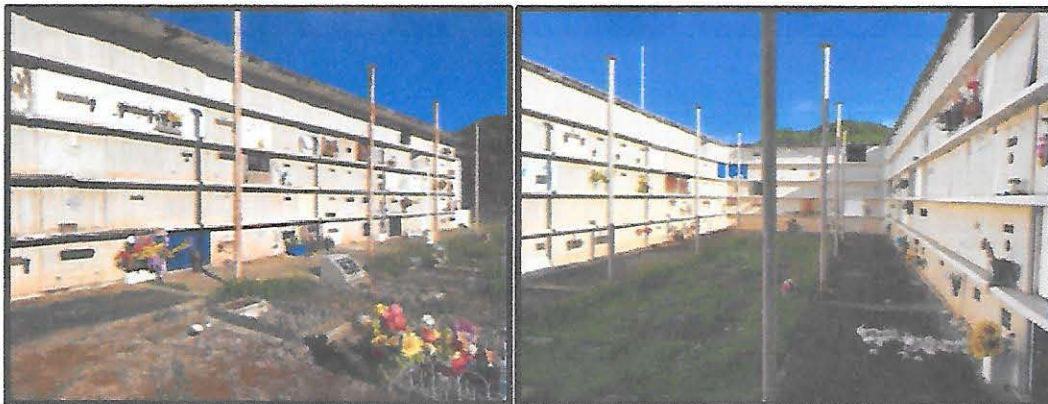
Enclosure (9b): Photos of Mausoleum Area and the many Crypts that have been vandalized by homeless and transients breaking into vaults and theft of valuables off bodies and brass urns