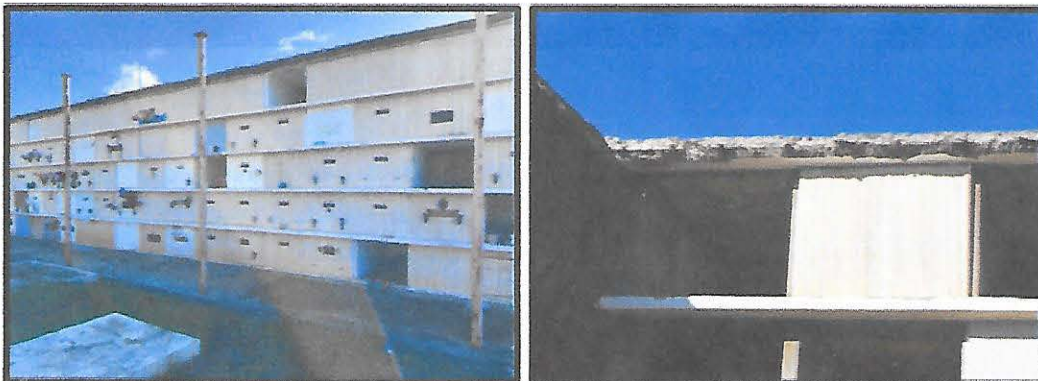
Enclosure (9c): Photos of Mausoleum, Crypt stone doors destroyed and crumbling concrete off the roof with major parts of the concrete overhang collapsed