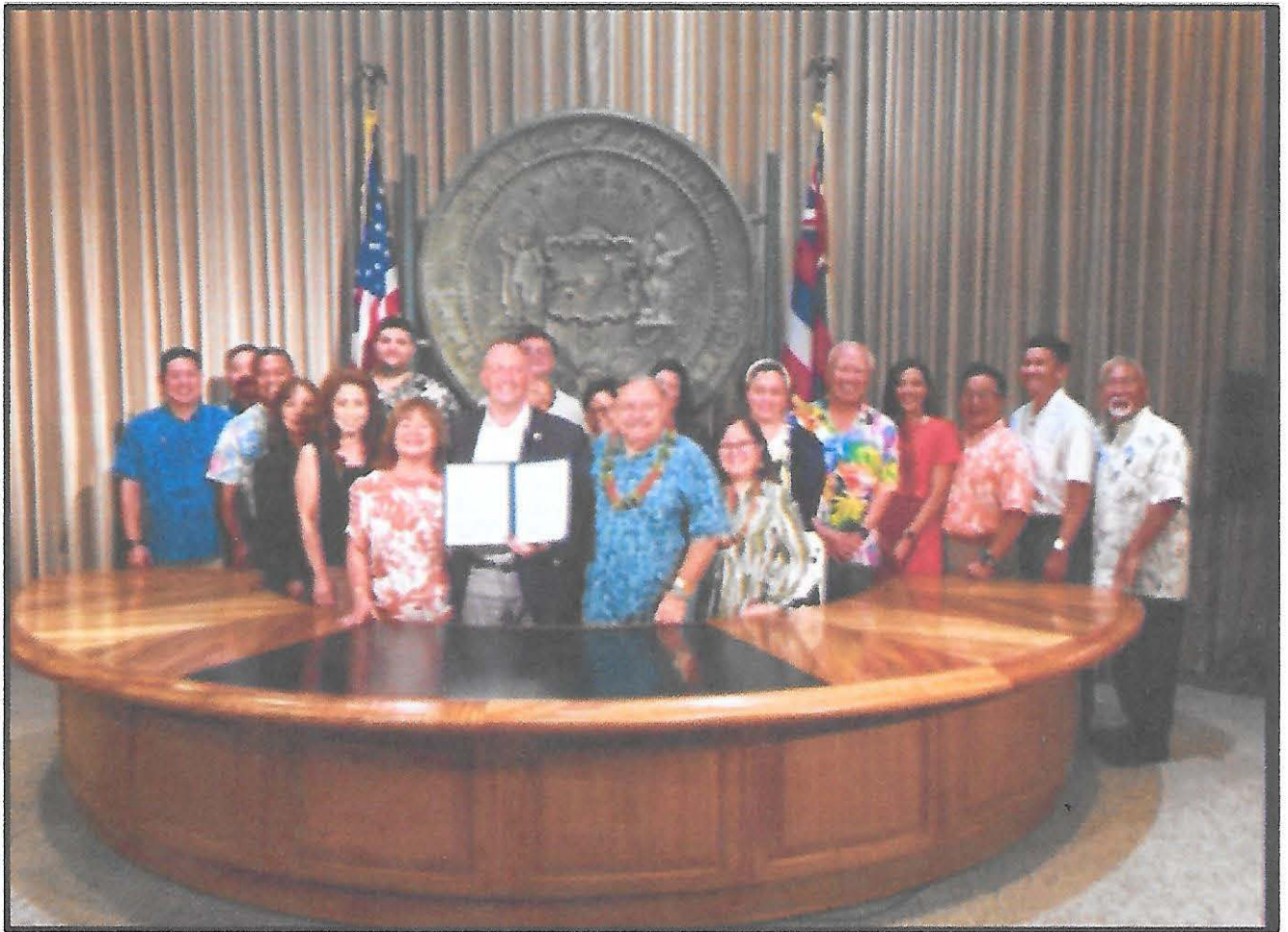
Enclosure (6): Office Call with Governor Green, Attorney General, Director DCCA, Pearl City Legislators and the Friends for Sunset Memorial Cemetery Nonprofit 501c3