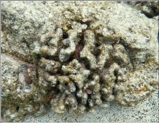
Rassy is one of many cauliflower corals that have died in Kahalu'u Bay since 2017.