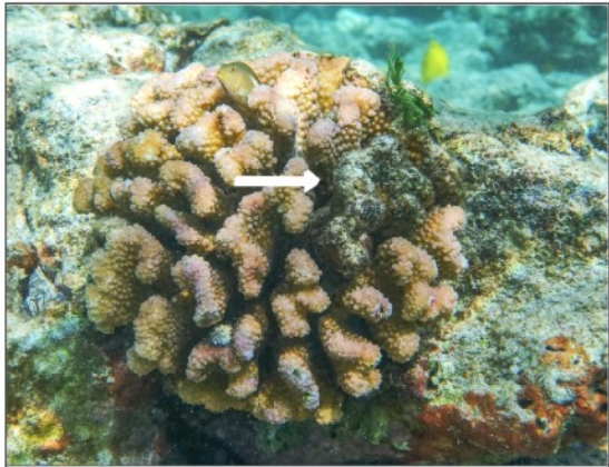
Note the beginning of coral decline.