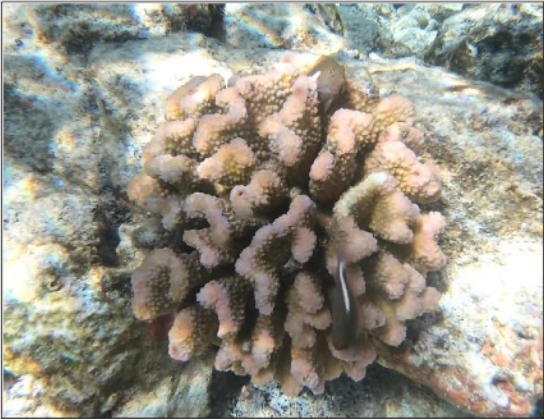
See the hawkfish sheltering in the coral colony named "Rassy"?