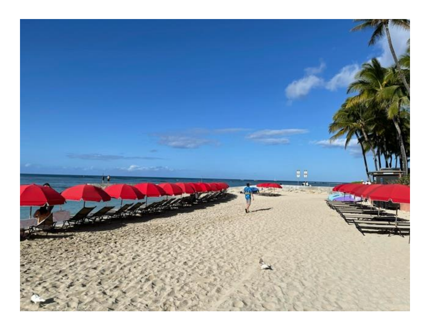
3/21/24 8:30 am Commercial Presetting on Public Easement Makai of Royal Hawaiian