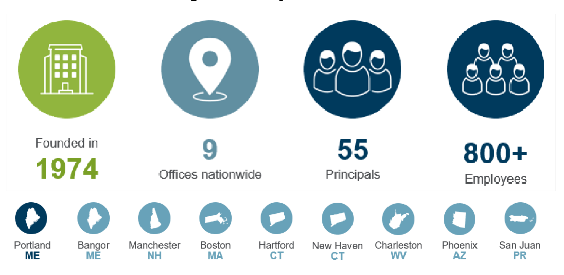
Figure 4-1: BerryDunn Overview

BerryDunn regularly performs audits of IT and business organizations and their processes, as well as the interactions they have with other agencies and departments. Independent audits and project assessments are core to our consulting practice, and our project teams have conducted enterprise-wide strategic risk assessments, project audits, and project health assessments for public-sector clients for more than 33 years.