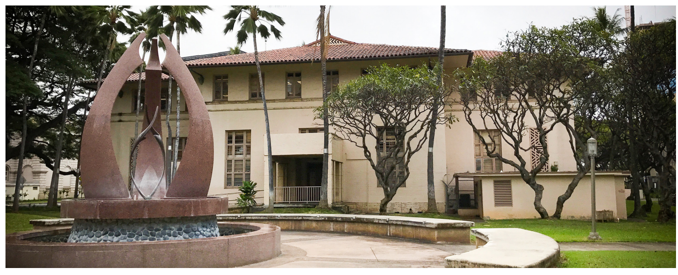
THE PRIMARY PURPOSE of the audit was to form an opinion on the fairness of the presentation of the financial statements for the Department of the Attorney General, as of and for the fiscal year ended June 30, 2022, and to comply with the requirements of Title 2 U.S. Code of Federal Regulations Part 200, Uniform Administrative Requirements, Cost Principles, and Audit Requirements for Federal Awards (Uniform Guidance), which established audit requirements for state and local governmental units that receive federal awards. The audit was conducted by KKDLY LLC.

Financial Statements, Fiscal Year Ended June 30, 2022