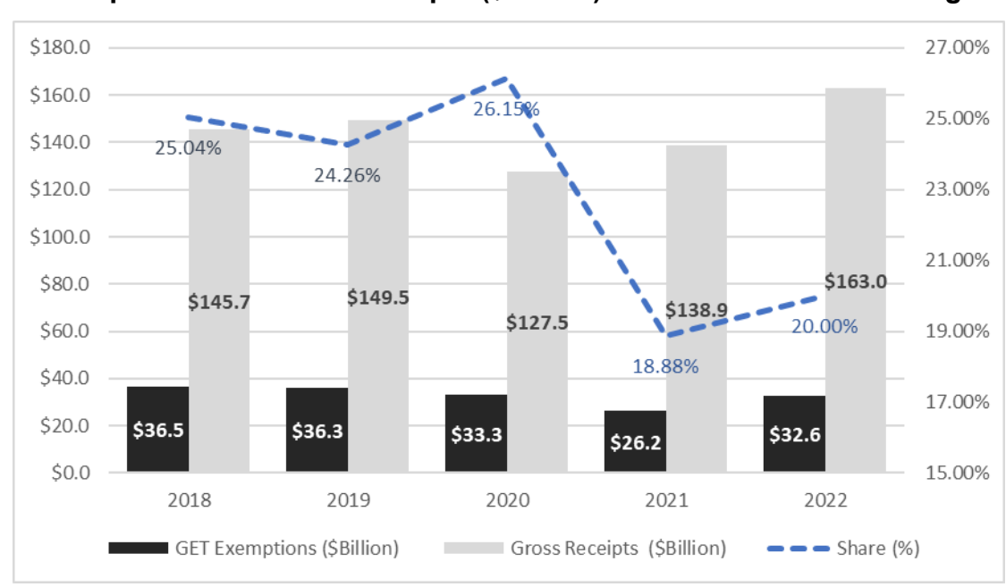
Figure 1 GET Exemptions and Gross Receipts ($Billion) for Tax Years 2018 through 2022

Figure 1 presents the amounts (in billions of dollars) of GET exemptions and gross receipts as well as GET exemptions to gross receipts ratios (%) for tax years 2018 through 2022.