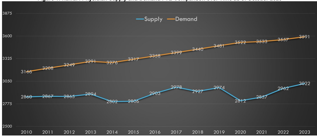
Figure 1: Hawai'i Physician Supply and Demand FTE Comparison over Time as of October 2023

(a total increase of 210 practicing active physicians over the last three (3) years). However, there remains a shortage of about 567 FTE of physician services to meet the demand [Figure 1] and over 757 FTE short when examining specific island and specialty needs. Table 2 reflects the physician shortage by county. The 2023 Hawai'i Physician Workforce Report provides more detail on the methodology and includes information utilizing Hawai'i county-specific data. Table 3 shows that the most significant shortages continue to be in primary care. However, other specialties and subspecialties are also needed throughout the state. Selected information from the Report to the 2023 Legislature, "Annual Report on Findings from the Hawai'i Physician Workforce Assessment Project" , is included below. The full report can be found on the JABSOM Hawai'i-Pacific Area Health Education Center website.