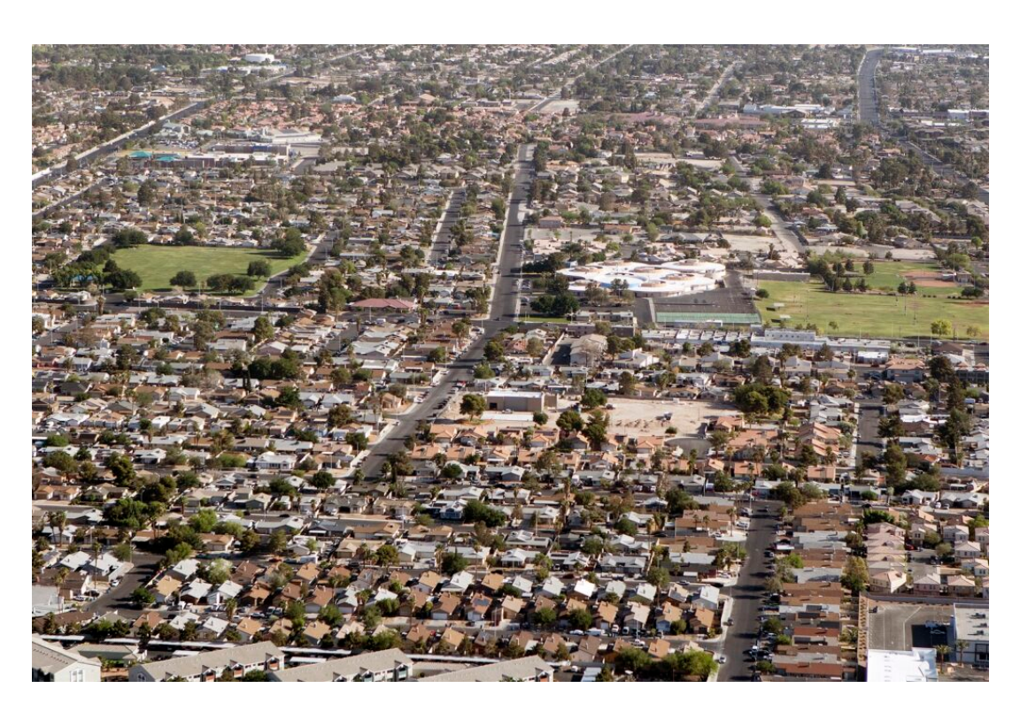
Most homeowners are oblivious to the goings on in their HOAS and the complex laws that govern them.

The state agency charged with regulating homeowners' associations is a smokescreen, designed to do the bidding of the multi-million dollar industry it oversees, at the expense of homeowners subject to HOA control, according to critics.