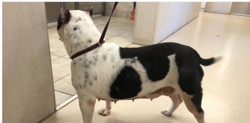
Exxy before and after surgery for an abdominal hernia, suspected to be secondary to a backyard C-section. She also has very short, cropped ears, which are prone to infection and usually an indication of amateur surgery.