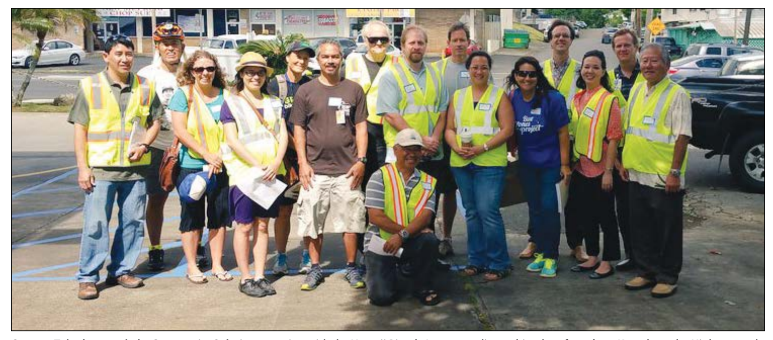
Senator Tokuda attended a Community Solutions meeting with the Hawaii Bicycle League to discuss bicycle safety along Kamehameha Highway and throughout Kaneohe.

the Attorney General to report to the Legislature on the number of untested sexual assault evidence collection kits being stored, plans and procedures for the disposition of new and untested kits, and related information.