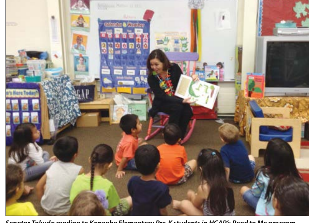
Senator Tokuda reading to Kaneohe Elementary Pre-K students in HCAP's Read to Me program.