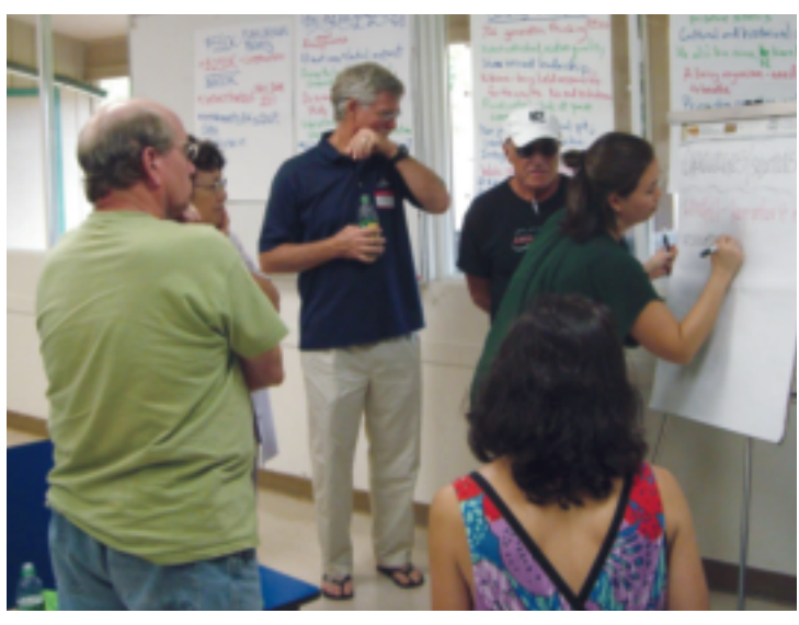
In April, Senator Tokuda and the Castle Foundation hosted a community meeting for Kawainui Marsh. In this break out session, the group is discussing challenges that may arise as they move forward on updating the Master Plan and possible solutions to those problems.

clause that was not clear before the purchase of a product or service. To address this issue, House Bill 663 would require clear and conspicuous disclosure of automatic renewal clauses and cancellation procedures of all consumer contracts.