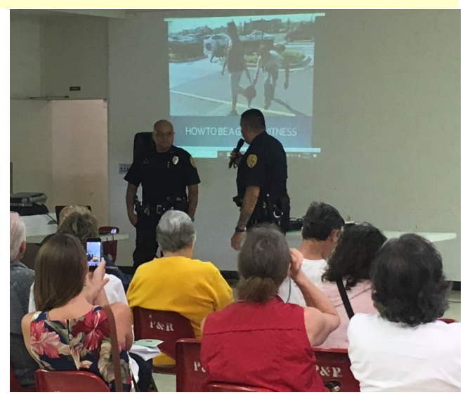
HPD gives tips on how to be a good witness.