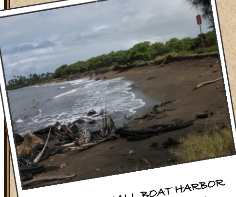
KIKIAOLA SMALL BOAT HARBOR SAND BY-PASS PROGRAM $1,400,000