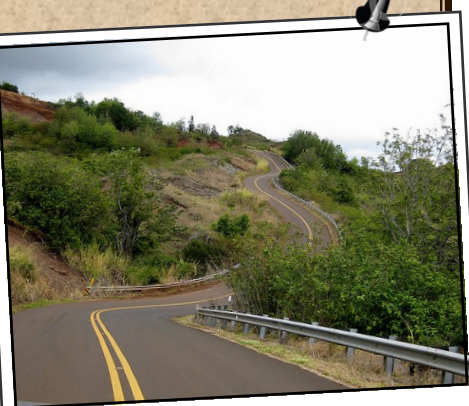
KOKEE ROAD, WAIMEA CANYON and KALALAU LOOKOUT IMPROVEMENTS $14,500,000