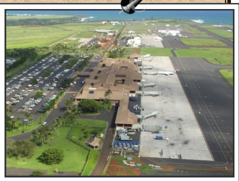
LIHUE AIRPORT, AIRFIELD and AHUKINI LANDFILL IMPROVEMENTS $35,600,000

КАИАІ ЕСОНОМІС ОРРОПТИНІТУ, INC. $80,000