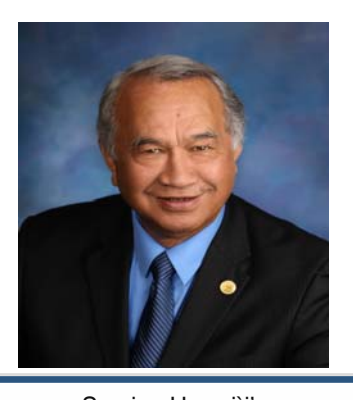
Serving Hawai`i's Senate District 1 - Hilo Majority Caucus Leader Chair, Committee on Tourism and International Affairs