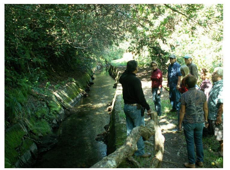
Senator Inouye visits the Kohala Ditch with constituents on December 29, 2014—six days after the storm that left the community with severe flood damage.

The second CIP request is for Waipio Valley and in particular, Ha Ola o Waipio, a new group formed within the Waipio community to continue the implementation of the 2006 NCRS Waipio Valley Stream Management Plan. The funding would provide equipment and construction costs to the group to provide preventative flood control measures and stream bank stabilization.