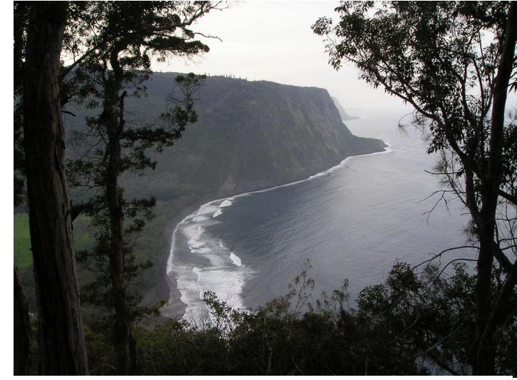
View from Waipio Valley lookout.

The first has to do with the Kohala Ditch. While the ditch itself carries water for over 20 miles, it runs through many privately owned parcels and serves over 90 businesses and residences. This CIP request is for a study to assess the feasibility of the state maintaining and improving the ditch to provide adequate and reliable water to the community.