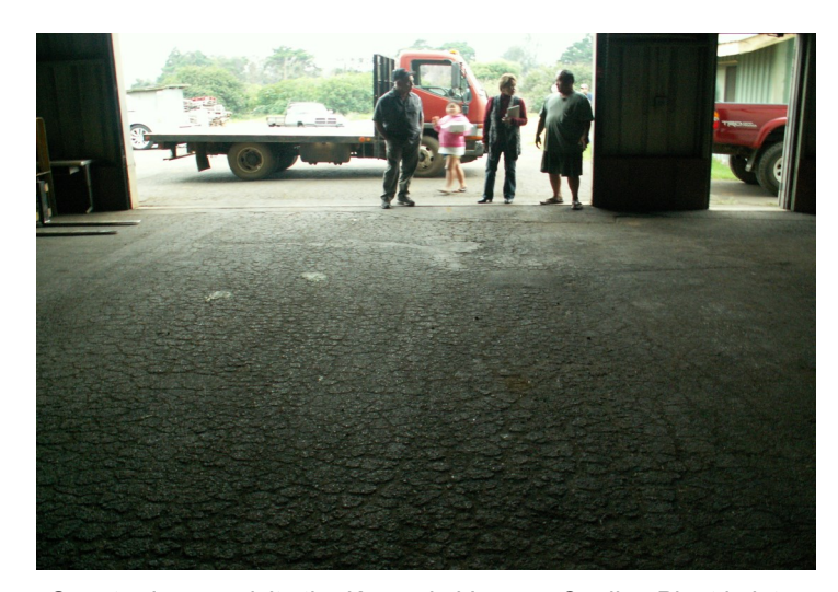
Senator Inouye visits the Kamuela Vacuum Cooling Plant in late December 2014.

The third request is for the Kamuela Vacuum Cooling Plant. The project will include planning, design and construction for improvements to the aging infrastructure of the building. Also included is the installation of up to a 100KW photovoltaic system that will help offset the costs of running the cooling plant and decrease costs for users in the community.