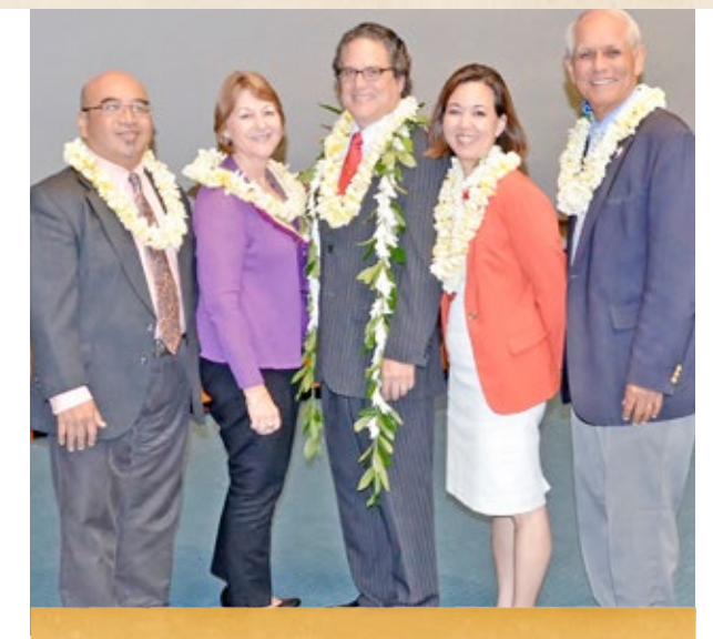
Vol.15 Issue 9 pg.2 • May 15, 2015

The budget includes $10 million for an 8 classroom building at Lahainaluna High School, the oldest school west of the Rockies, and $2.25 million for emergency dredging and replacement of buoys at Lahaina Small Boat Harbor.