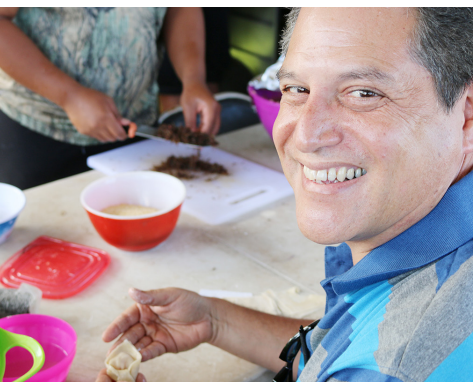
Making O'io Gau Gee at Mapulehu, Moloka'i. June 15, 2014.