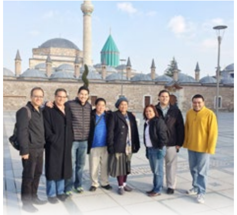
Top: Sen. English and delegation meet with the Governor of Istanbul, Turkey. Above: Hawai'i Delegation visits the tomb of Rumi in Konya, Turkey. Nov. 29, 2013.

For more information on the Pacifica Institute visit: http://www.pacificainstitute.org