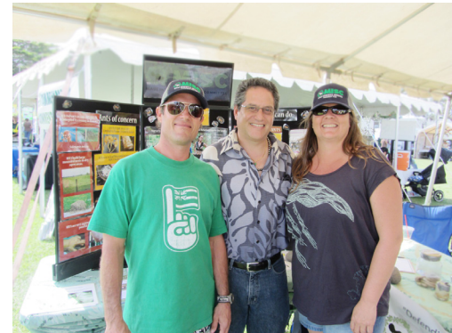
Sen. English visited the Maui Invasive Species (MISC) educational booth and activities during the East Maui Taro Festival. April 21, 2012.