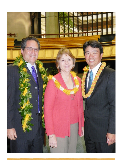
Vol.12 Issue 13 pg.2 • Dec. 1, 2012

For more information visit: http://hawaii.gov/elections/reapportionment/