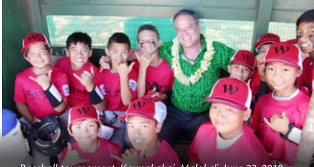
Baseball tournament. Kaunakakai, Moloka'i. June 23, 2018.