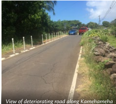
View of aeteriorating road along Kamenamena V Highway. Kalua'aha, Moloka'i. June 24, 2018.

The same day, while on Moloka'i Sen. English also attended The King's Lū'au presented by the King Kamehameha Celebration Commission in commemoration of the King Kamehameha Holiday. The lū'au was also in