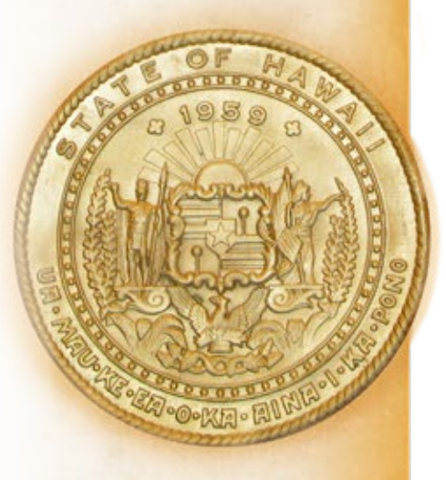
Hawai'i State Legislature Bill Status and Documents www.capitol.hawaii.gov/

Member, Senate Committee on Ways & Means