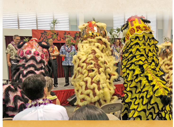
Vol.18 • Issue 4 • pg.2 • March 1, 2018

$2,000,000 in funds were also released for design and construction for Phase 1 of a non-potable agricultural water system at the Hawaiian Home Lands in the Keokea Farm Lots Subdivision in Keokea, Maui.