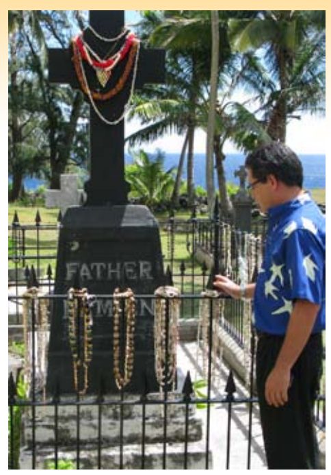
Sen. English visits the gravesite of Father Damien during a historic April 2008 visit to Molokai. During this visit, Senator English presented to former leprosy patients forcibly confined to the remote Kalaupapa Senate Concurrent Resolution 208, a formal apology for the hardships suffered by the people of Kalaupapa.