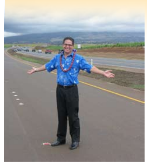
Sen. English celebrates the opening of Haleakala Highway widening project Dedication Ceremony, - September 2008