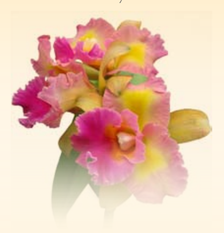
To learn about this orchid and more, please visit: <a href="http://www.haikumauiorchids.com/">http://www.haikumauiorchids.com/</a>