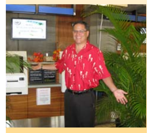
Dedication Ceremony, Kahului Airport Common Use Passenger Processing System, Kahului Airport, - Oct. 2009