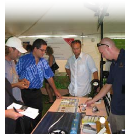
August - 2008 The 1st Annual Maui ISLExpo offered a variety of presentations and panel discussions from leading sustainability experts, demonstrations of alternative energy technologies, sustainability related exhibits and more. For more information visit: http://sustainablemaui.org/