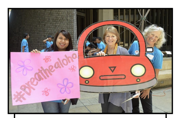
Celebrating Kick Butts Day at the Capitol with Tobacco Free Hawai'i!

HB2252 HD1 SD2 CD1 supports Hawai'i families by requiring hospitals to adopt patient-centered discharge policies. It gives patients the opportunity to designate a caregiver and allows that caregiver to participate in the discharge planning process. Proper discharge planning along with medical support and education for caregivers can extend the quality of our seniors lives and substantially lower hospital readmission rates.