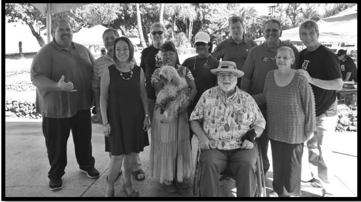
The Maui Economic Opportunity Inc. was chartered on March 22, 1965. It is a private non-profit Community Action Agency.

Kupuna groups in our district are the Pukalani Pensioners, Haliimaile Vitagold, Kula Camellia, Makawao Hongwanji, Kula Gateball and Kula AARP.