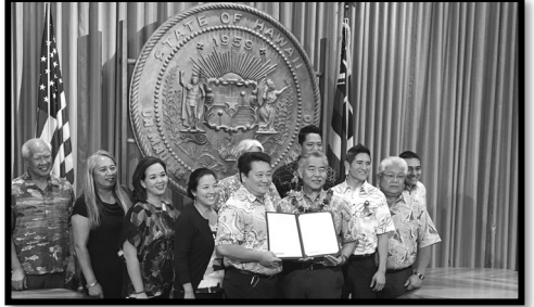
Legislators and the Tsuji's family watched Governor Ige sign the bill into Act 163.