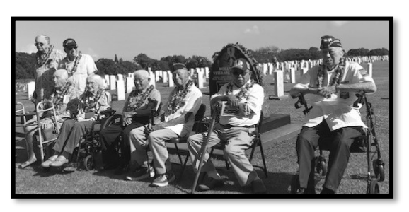
Memorial Day honoring the WWII Veterans at the Maui Veterans Cemetery in Makawao.

Honors veterans and their role in Maui history by renaming Mokulele Highway as Maui Veterans Highway.