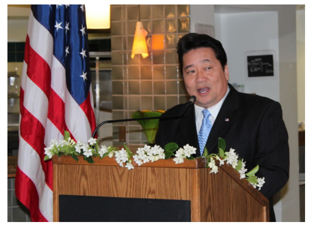
Speaking at the 63rd Annual Eagle Scout Recognition Dinner.