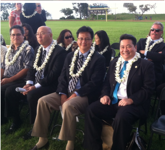
At King Kekaulike High School graduation.

SB1087, Green Infrastructure Loan Program, makes green infrastructure installations accessible and affordable for Hawaii's consumers, helps achieve measurable costs savings, and helps achieve Hawaii's clean energy goals. Some other accomplishments of the bill include: establishing the Hawaii Green Infrastructure Loan Program and the Hawaii Green Infrastructure Authority, bond fund, special fund and authorizing the creation of green infrastructure property.