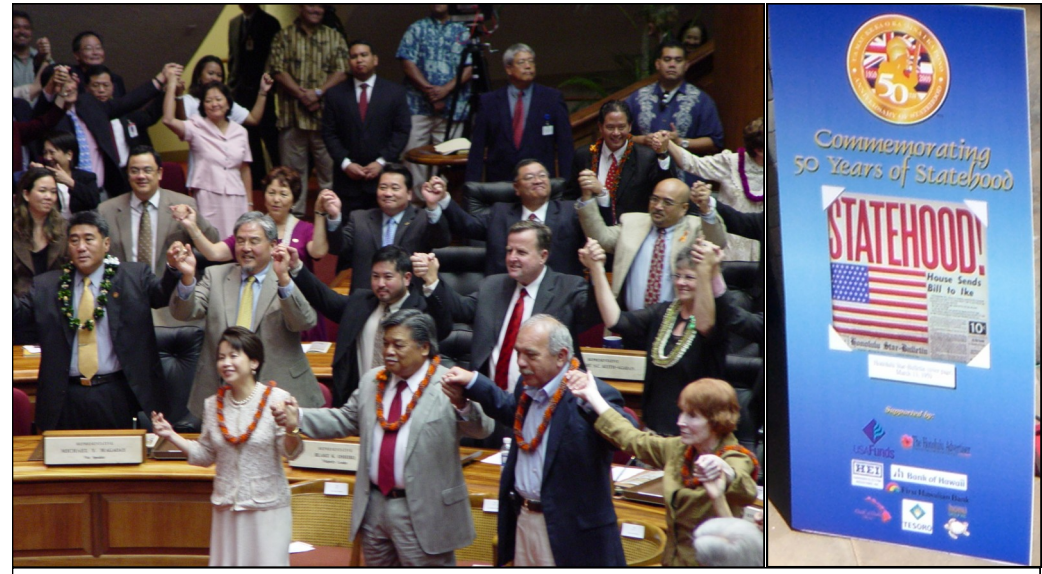
State Legislators stand to sing Hawaii Pono'ī in Celebration of Hawaii's 50th Year as a state.

On Wednesday, March 18th, 2009, the 50th state of the United States of America turned 50 years old. At the Hawaii State Capitol past governors and lawmakers who helped shape the foundation of our government and other dignitaries joined the 25th Legislature and the administration in commemorating this historic event.