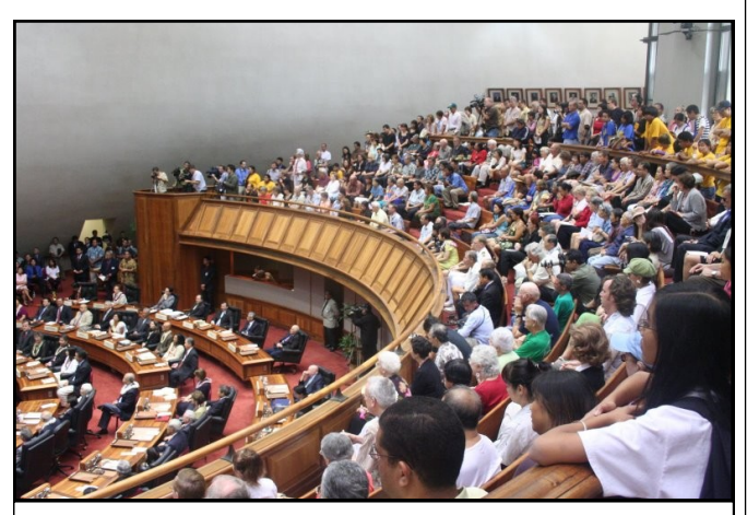
The public filled the chamber of the House of Representative to help commemorate Hawaii's 50 years of statehood