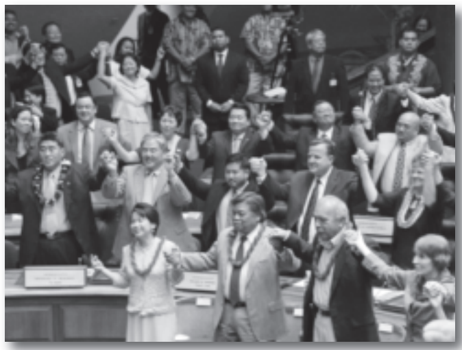
Our past and present came together, in Chambers, during the 2009 legislative session in recognition of the 50th anniversary of state-hood.

Keiki Care. The Keiki Care pilot program provides basic health insurance for children who are uninsured and do not qualify for other programs. The administration terminated Keiki Care last year, but the legislature saw the need within the community and extended it to 2012. The primary health care services will be provided by federally qualified health centers through an appropriation of $200,000 per year. This bill was