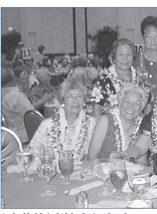
At the 33rd Lei of Aloha Seniors Luncheon.

Housing Trust Fund (RHTF) will receive approximately $15 million next year (triple the funds available in