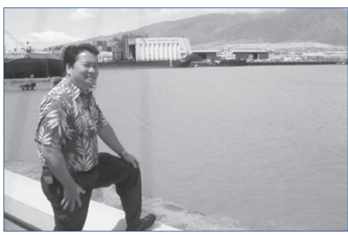
Assessing Kahului Harbor needs.