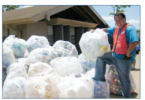
Co-Sponsoring Kanoelani Elementary School's community recycling project.