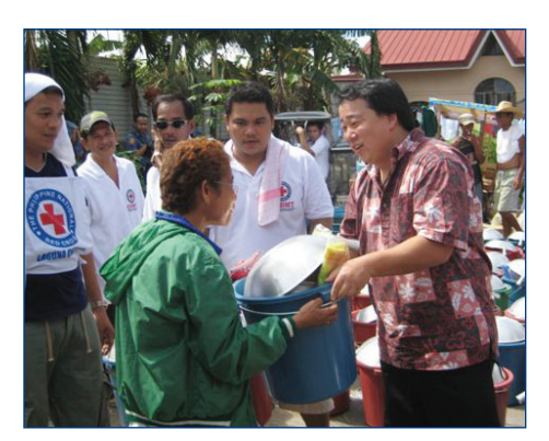
Providing aid and disaster relief to a flooded Filipino village after 4 typhoons hit the Philippines in the fall of 2009.

Act 99-Strengthening Graffiti Laws. Requires a person convicted of criminal property damage by graffiti to remove the