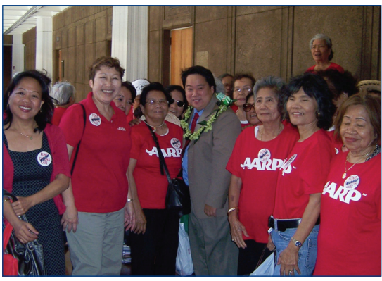
Rallying with Kupuna at the Capitol for funding for senior programs.