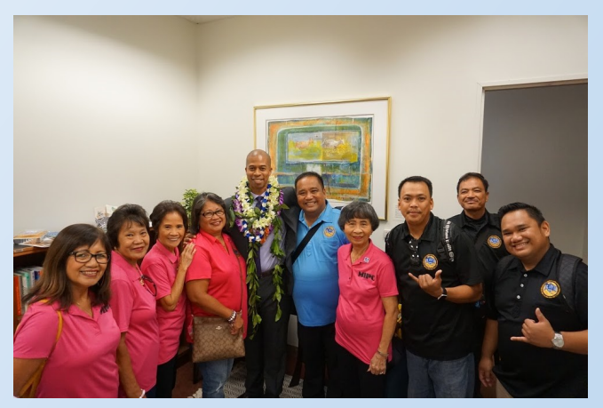
Opening Day at the Hawaii State Legislature with members of ILWU

For the 2019-2020 Legislative Session, the House of Representatives decided to combine Lower & Higher Education committee together. The idea is to have a seamless continuum from Pre-K to college. After the two year period, we will assess if it continues to make sense to keep the committees together or separate them again. Our office is also now responsible for putting together the budgets for the subject matter governmental entities, which include, Public Charter Schools, Executive Office on Early Learning, Hawaii Public Libraries, and the University if Hawai'i System. This is a tremendous responsibility and opportunity for our office to be more intimately involved in helping shape the operational budgets for roughly 40% of the total state budget.