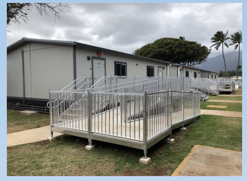
New STEAM building at Kahului Elementary