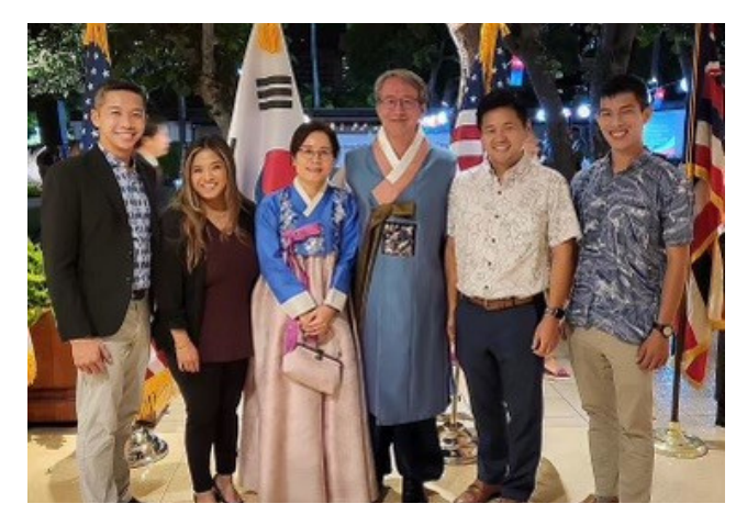
At the Republic of Korea National Day and Armed Forces Day reception.