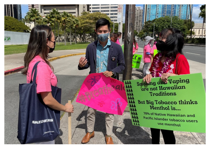
Rep. Sayama speaking with HSTA members and sign wavers about the importance of eliminating vaping products from Hawaii's schools.

Prohibits the sale, offer for sale, or possession with intent to sell or offer for sale a flavored tobacco product, including an electronic smoking device, and the mislabeling as nicotine-free, or the sale or market for sale as nicotine free, any e-liquid product that contains nicotine. Establishes fines for violations.