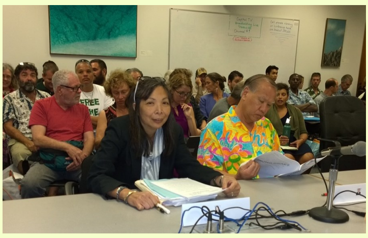
Conference Member: At conference committee for HB321, Medical Marijuana Dispensaries. (I was 1 of 5 house committee members)