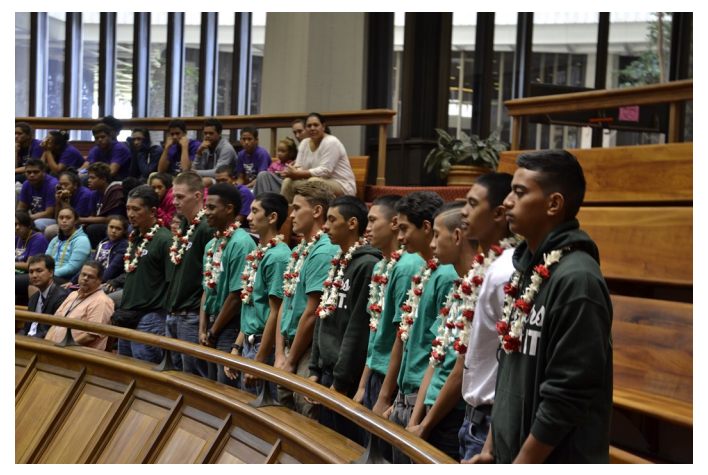
PAHOA HIGH SCHOOL DAGGERS, 2015 BIIF Division II champions visiting the State Capitol while they were on Oahu for the state championship.