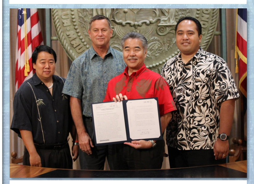
Rep. Pouha at Senate Bill 284's ( Turtle Bay easement funding ) bill signing ceremony with Rep. Yamane, Sen. Riviere and Gov. Ige.