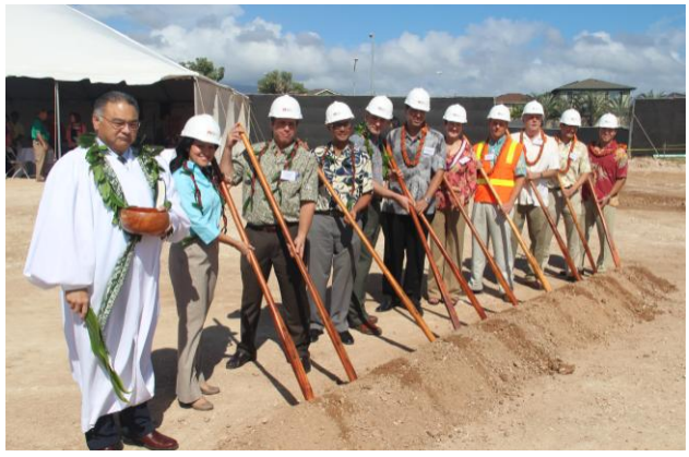
Laulani Village Shopping Center project groundbreaking

A recreation area at Hoakalei Resort is also coming to 'Ewa Beach. The family-friendly lagoon will be open to the public and give residents more opportunities to play and exercise close to home.