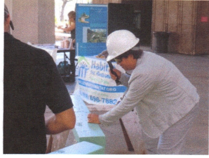
Hammer time? Here Rep. Dee is participating in Habitat for Humanity's nail driving contest. She hammered 5 nails in one minute!