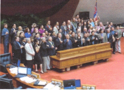
The Hawaii State House of Representatives honored the cast and crew of the television series Hawaii Five-0. Here the reps are taking pictures with some of the honorees