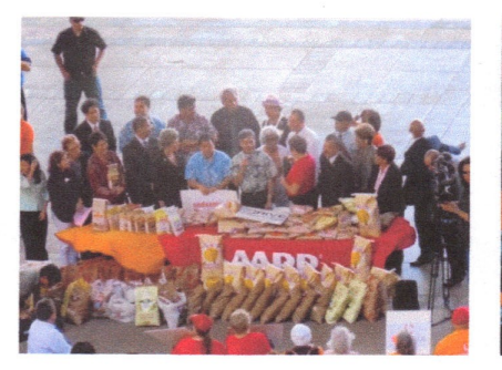
Rep. Dee and her legislative colleagues gather to support Kupuna Day at the State Capitol. Here they are collecting bags of rice to support AARP's food drive