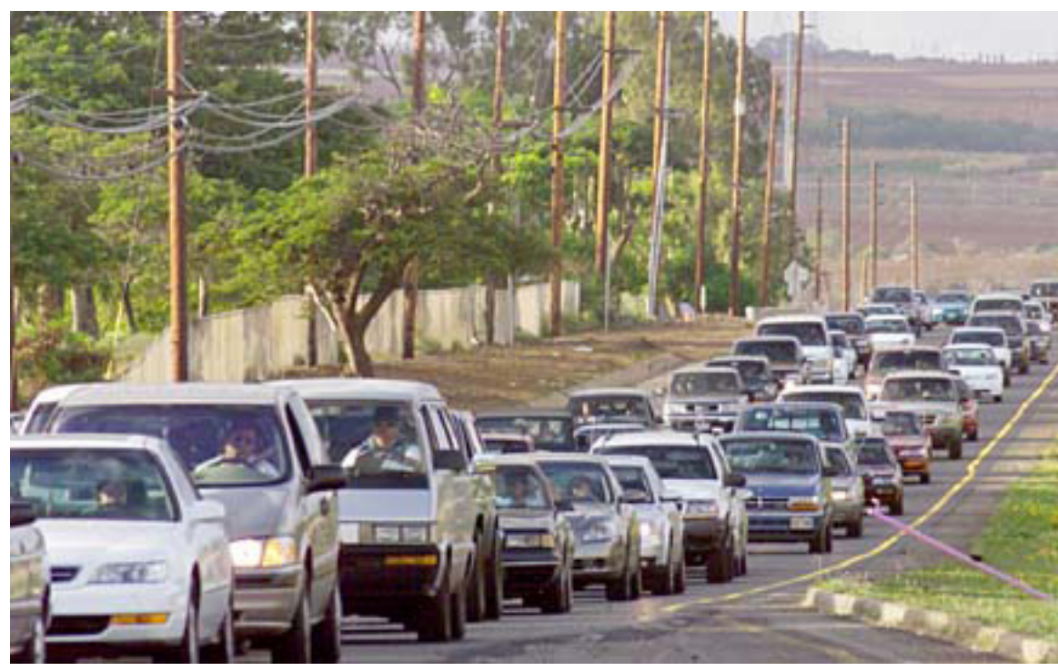
Our community continues to need more traffic lights and pedestrian safety measures.

Earlier this month, I sent a letter to the City and State traffic divisions asking for updates on a a couple of previously requested improvements. That letter also included a number of requests for new improvements for the 'Ewa community.