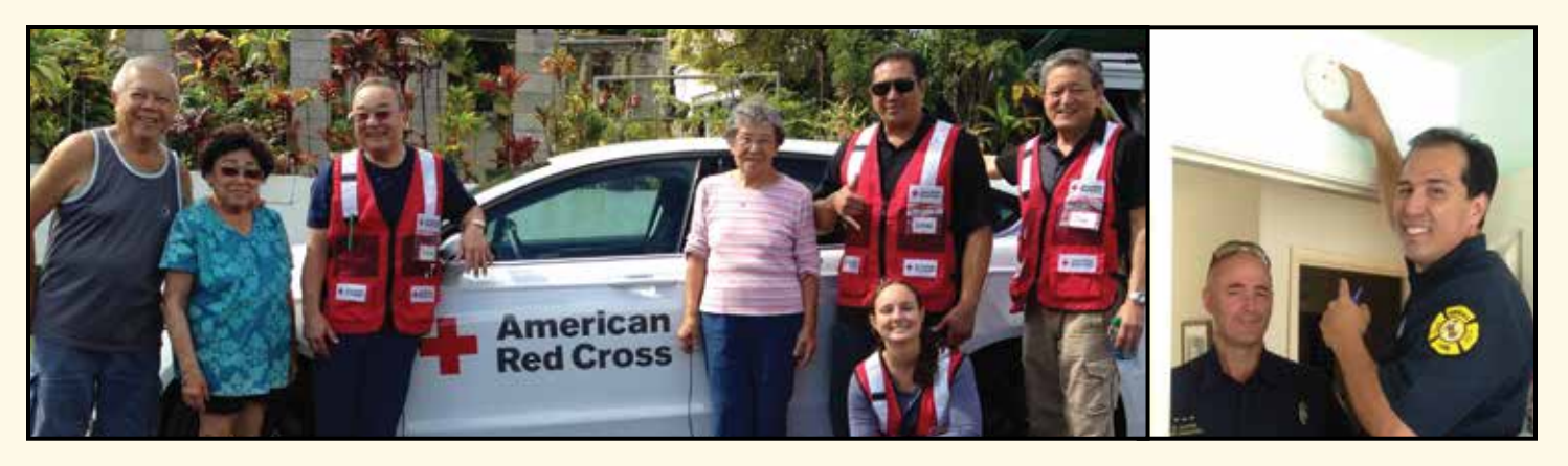
Become a Red Cross Volunteer with the Home Fire Preparedness Campaign and help our community and seniors' be fire safe. We have Home Fire Preparedness Basic Training each month; a 2 hour training that equips you to join a Smoke Alarm Response Team that hold month installation events. We welcome new volunteers.

The Red Cross Home Fire Preparedness Campaign's goal is to reduce home fire fatalities by installing smoke alarms, teaching residents how to test them monthly, and helping you create and practice a fire escape plan to get out of your home in 2 minutes or less.