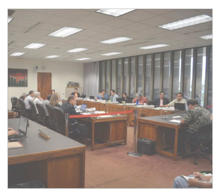
Rep. Jordan at a House Finance Committee hearing.

Real Property Tax Exemption (HB1293 HD1): Clarifies that the real property tax exemption for property owned as a primary home covers persons who own, but cannot occupy in, the primary home due to a serious medical condition; provided that they do not rent or lease out that property.