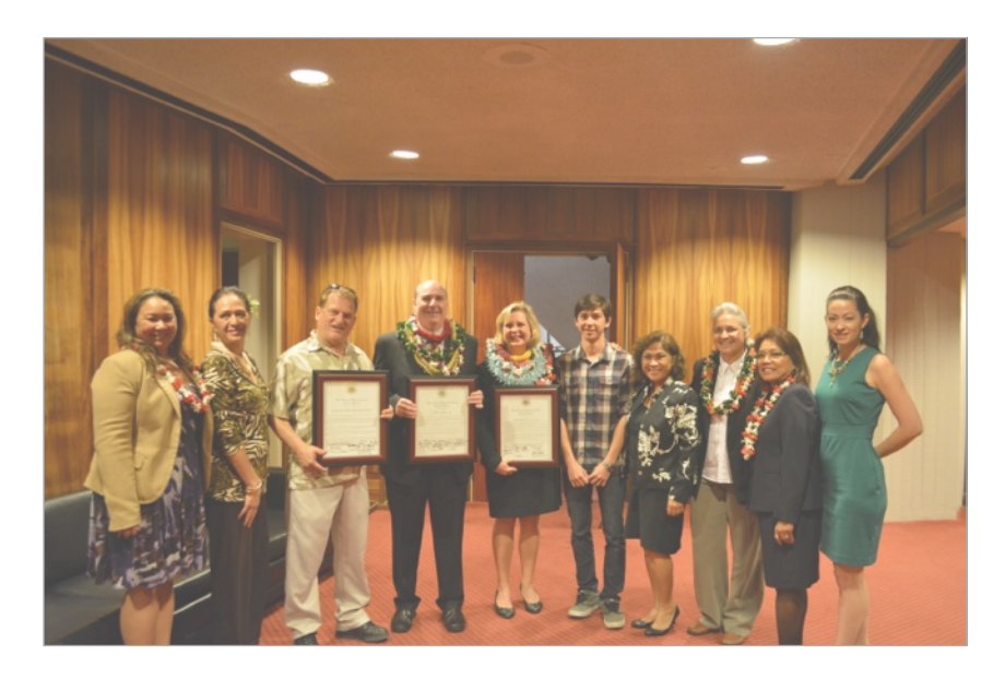
ABOVE: House Representatives with board members, professionals, and supporters of the WCCHC.

Capital Improvement Funds totaling $2 million for the Waianae Coast Comprehensive Health Center (WCCHC) to rebuild the emergency services department is being released. The legislature appropriated these funds in the 2012 budget. The State House also recently honored and commended WCCHC for its commitment to the health and well-being of the people of the State of Hawaii and recognized WCCHC for fulfilling vital healthcare and emergency services for the underserved and isolated residents of the Waianae Coast. In keeping with its founding vision, the State House noted that WCCHC seeks to address health disparities, improve population health, and reduce health inequalities despite financial and cultural barriers. It has also provided accessible, quality, affordable, and comprehensive health care while preserving native Hawaiian culture and traditions.