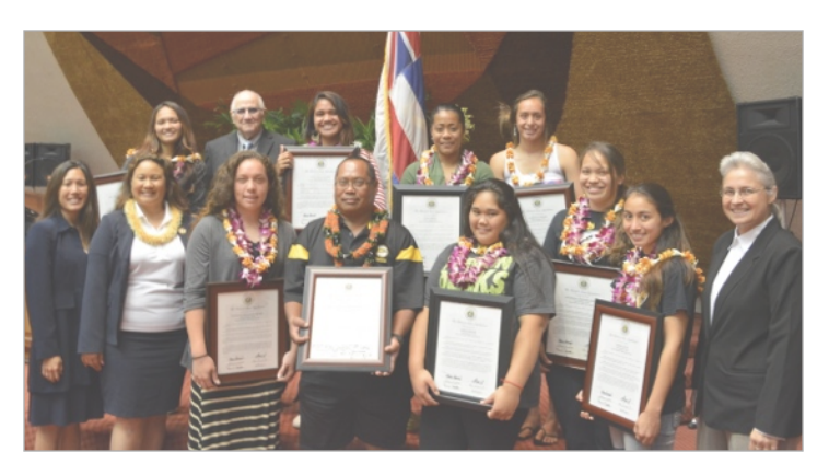
ABOVE: State House Honors the Nanakuli High & Intermediate School Lady Hawks.

learning system an Early Childhood Education Program, to be administered by the Executive Office on Early Learning, upon the ratification by the voters of Hawaii of a constitutional amendment authorizing the use of public funds to provide early childhood education through private providers.