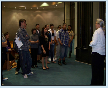
Students from Waianae High's Business & Human Services academies.