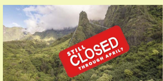
If you would like updates on the project, please go to dlnr.hawaii.gov/dsp/parks/maui/iao-valley-state-monument

The monument has been closed since Aug. 1 of last year for the final phase of its slope stabilization project and parking lot improvements. The monument was scheduled to reopen on Jan. 14, but the closure was extended through February.