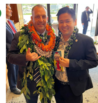
Visiting with Governor Green after listening to his State of the State Address in which he laid out his plan for this upcoming legislative session.

Follow HB 1049 or any bills listed above at capitol.hawaii.gov.